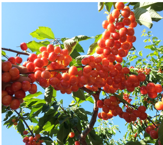
Rainier cherries grown with Pacific Gro in Yakima valley